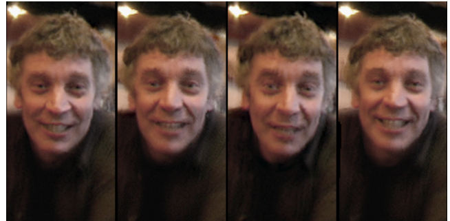
Figure 2: Four frames of laughing man. All of the images shown here are new and were not present in the original sequence.

a texture map (warped into a neutral pose). The combined PCA space is treated by us in the same way as the image eigenspace used for the campfire sequence, but exhibits the Gaussian nature required by the ARP. Shown below is a synthesised sequence of a man laughing created using such an appearance model. Once again the sequence captures the feeling of the original sequence well with the man smiling, laughing, shaking his head and rocking back and forth. The minor distortions present are due to the image warping technique used and we will overcome these. A second non-gaussian example fits a spline through the data space a synthesises a horse running on a treadmill using the distance along the spline, and an offset from the spline.