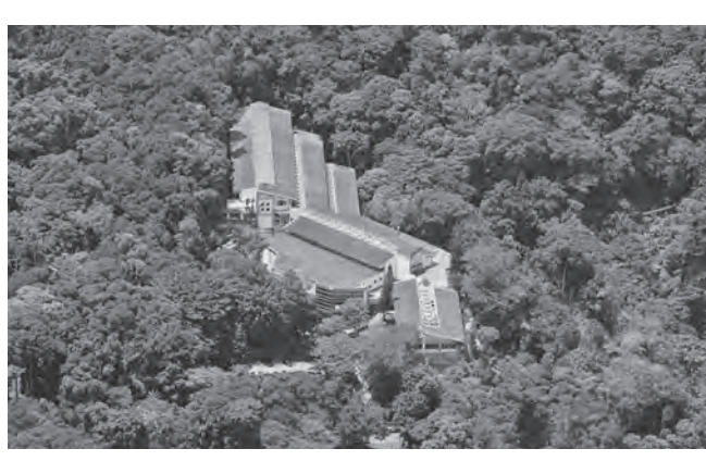
IMPA's current location.

IMPA's current faculty continues to play a leading role both regionally and globally. The institute has 40 regular professors (tenured and tenure-track), two special visiting professors (Etienne Ghys and Bruce Reed), two extraordinary professors (Artur Ávila and Harold Rosenberg) and five emeriti. Current research areas include: analysis and partial differential equations; algebraic geometry and representation theory; combinatorics; complex geometry and foliations; computer graphics;