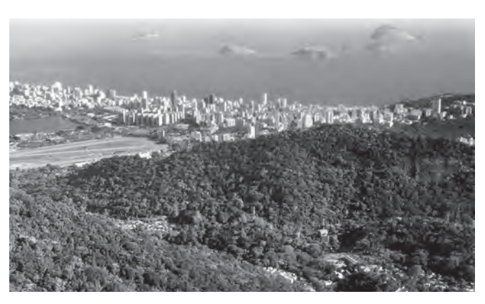
IMPA's location is in the right bottom corner of the image.

IMPA plays an active role in disseminating mathematics. A significant proportion of existing Portuguese mathematical literature (used in universities throughout the Portuguese speaking world) comes from IMPA's publishing house. IMPA runs Summer programmes that have up to 700 participants and organises a dozen international conferences every year. It hosts training programmes for high school teachers and is responsible for the Mathe-